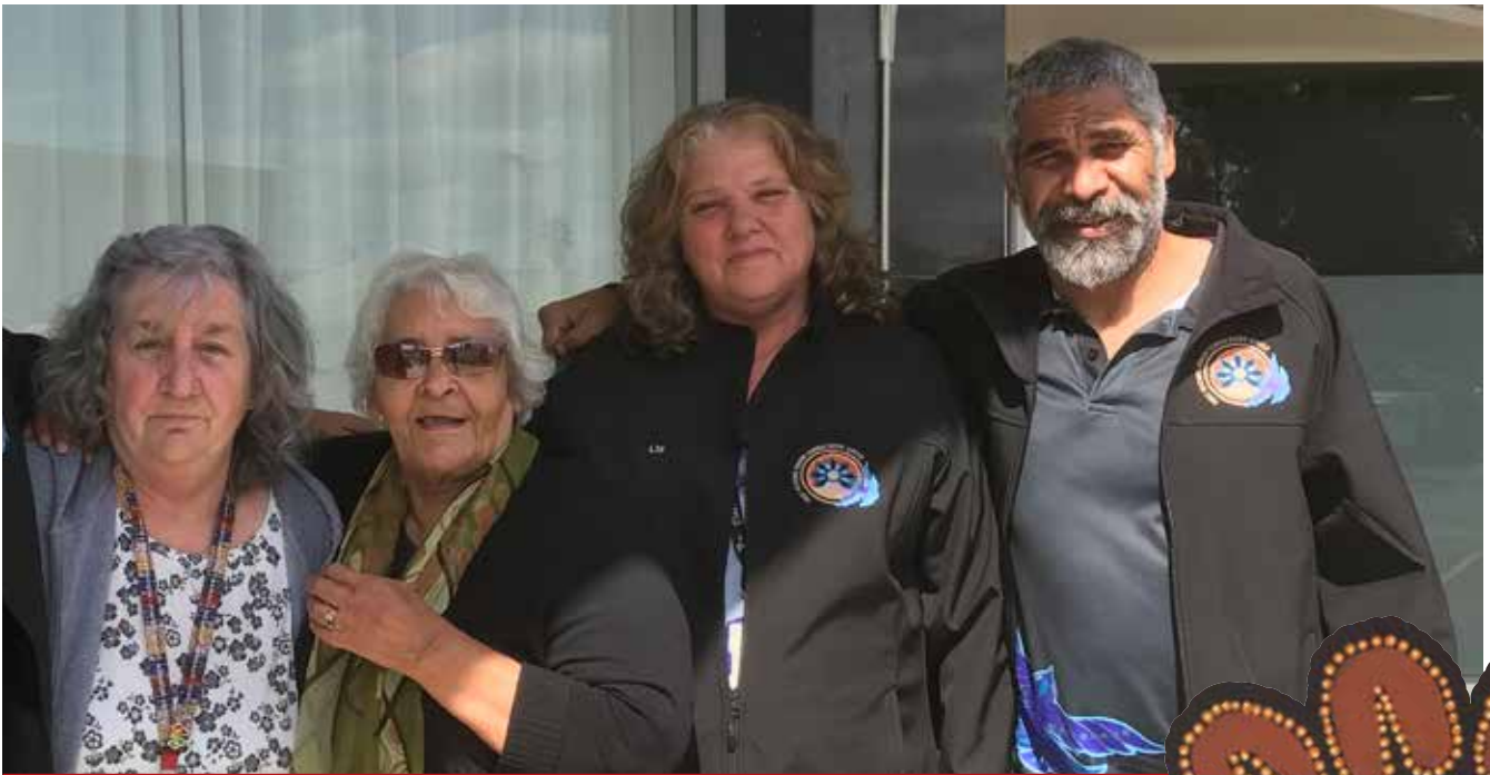
Photo: Some Members of the First Nations Senior Consultative Circle