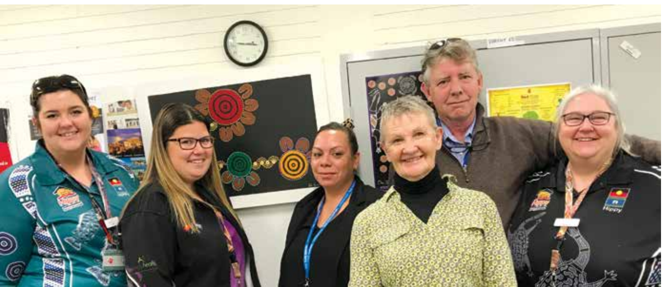
Photo: Some members of the Internal Aboriginal Network