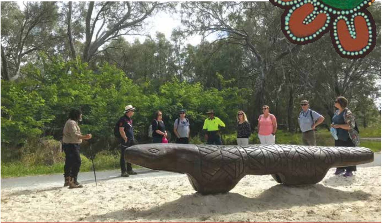
Photo: Gateway Executive on Burraja Cultural Journey